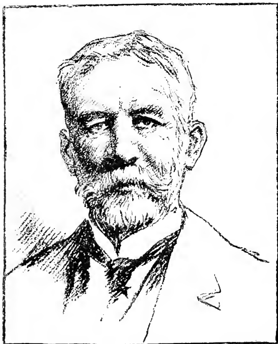
General von Bernhardt